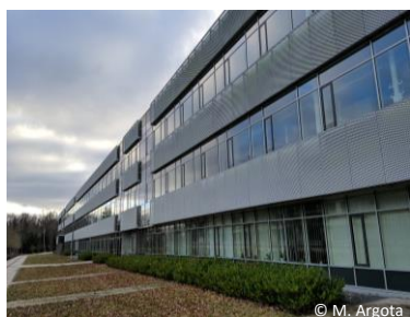
The head office of TRR 174 is located in the New Chemistry Building of the University of Marburg, Germany.

TRR 174 is a DFG-funded Transregional Collaborative Research Center. In this consortium 16 research groups, located in the Marburg and Munich areas, have joined forces to implement a comprehensive and highly coherent research program that investigates the molecular mechanisms controlling the